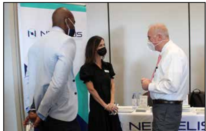
The exhibit hall provided attendees with the opportunity to learn about products and services that benefit neurologists. More than 30 vendors were represented at the 2021 meeting!