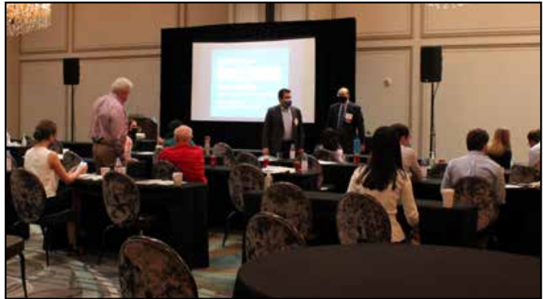
More than 65 gathered for AAN's 2021 conference in August at the Grand Bohemian Hotel in Mountain Brook.